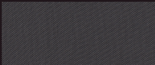
5% 030001 | Charcoal/Grey