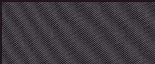
10% 030001 | Charcoal/Grey