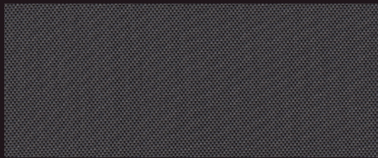
3% 030001 | Charcoal/Grey